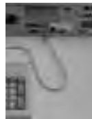
Before installation of logger