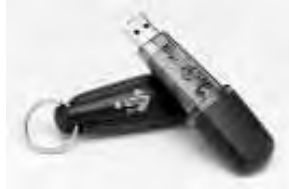
USB flash drive on keychain