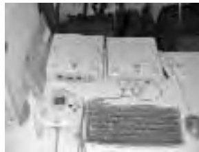
Modified Sega® Dreamcast that allows remote network access