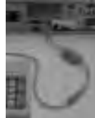
After installation of logger