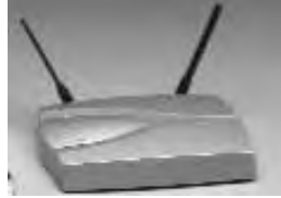
Air magnet: Network interception and detection device used to monitor networks, wireless communication, and all associated network activity.