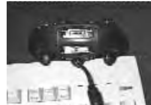
Xbox® controller showing a memory port modified to accept USB devices (e.g., keyboard, mouse)