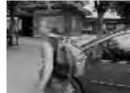
Mobile antenna hidden in a backpack for the purpose of detecting wireless network.