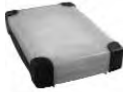
External hard drive