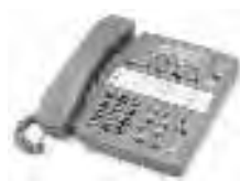
No tape (digital)