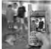
Integrated cell phone, PDA with e-mail, text messaging, Web browsing, and digital camera