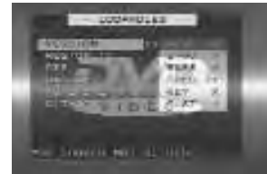
Modified menu on a hacked DVD player