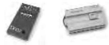
WiFi Detector: Wireless network signal locator and strength detector.