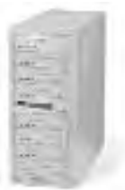
Mass media duplicator