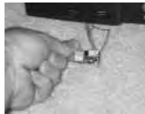
A closeup of a BIOS selector switch. The orange/brown wires coming from the LED on the right are to control a set of blue LEDs to determine what mode the unit is in. The four DIP switches are used to select which section(s) of the flashable BIOS memory is selected. The single switch next to it toggles between this Chipped BIOS and the native Xbox BIOS.