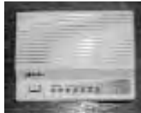
External fax modem