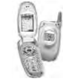
Traditional cell phone with scheduling features