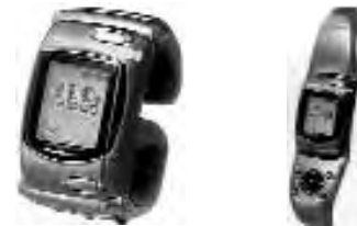
A standard cell phone incorporated into a wrist watch