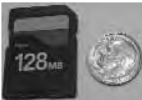
Secure digital (SD) card