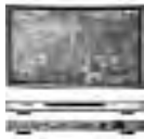
Front and back view of home theater system