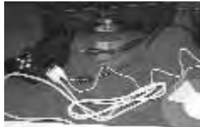
Xbox® and controller modified for use as a computer with mouse and keyboard attached