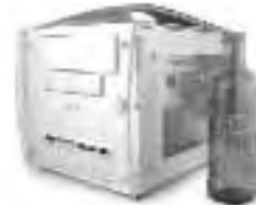
Ice Cube: Small personal computer with carry handle