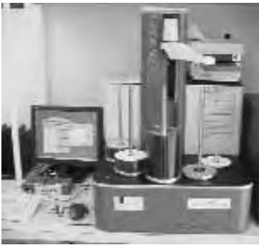
CD and DVD duplicator