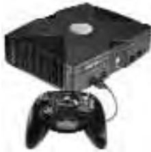
Xbox® gaming console