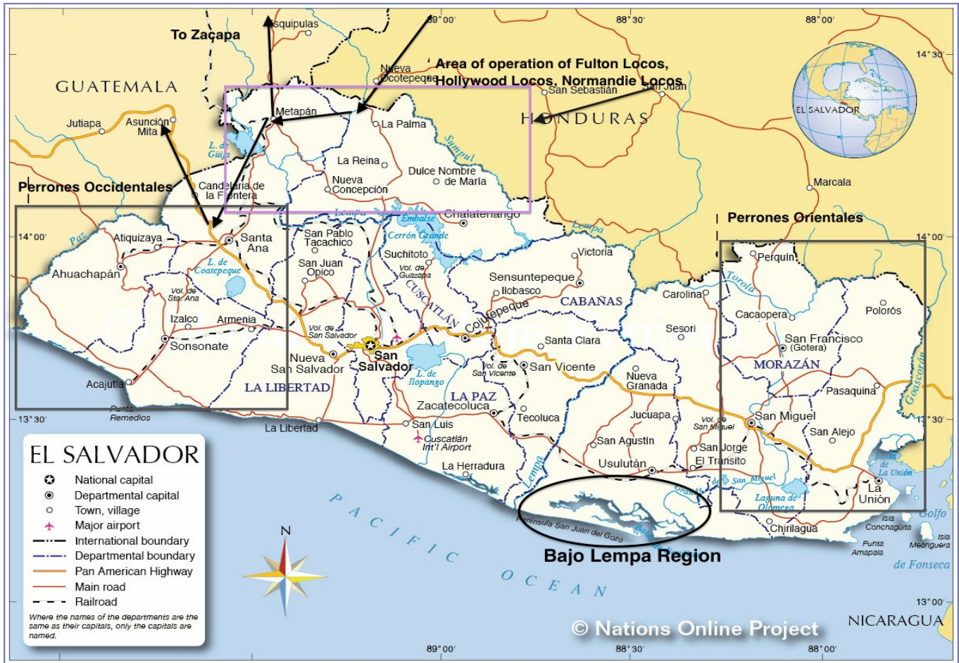
Figure 2: Map of El Salvador Showing Cartel de Taxis Operating area And Bajo Lempa Region

There is anecdotal evidence that the relationship between MS-13 to the drug trade is becoming more direct. In early November 2012 the Salvadoran National Police intercepted a launch on the Pacific coast near the town of Metalío, Sonsonate province and seized 113 kilos of cocaine. It was the largest cocaine seizure to date of cocaine in El Salvador, and a launch with a similar amount evaded capture. 18