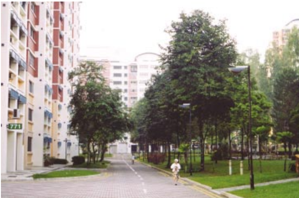
Residential apartments with windows overlooking carpark and park allow for clear sight lines

Sight line is defined as the desired line of vision in terms of both breadth and depth. The inability to see what is ahead along a route due to sharp corners, walls, earth berms, fences, bushes or pillars can be serious impediments to the feeling of being safe. Large columns, tall fences, overgrown shrubbery and other barriers blocking sight lines adjacent to pedestrian paths could shield an attacker. Alternatively, low hedges or planters, small trees, wrought iron or chain-link fences, transparent reinforced glass, lawn or flower beds, benches allow users to see and be seen and usually discourage crime and vandalism.