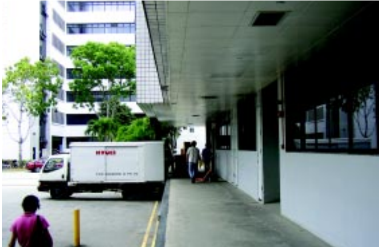
Neat, visible and well-lit loading/ unloading areas minimise potential for hiding