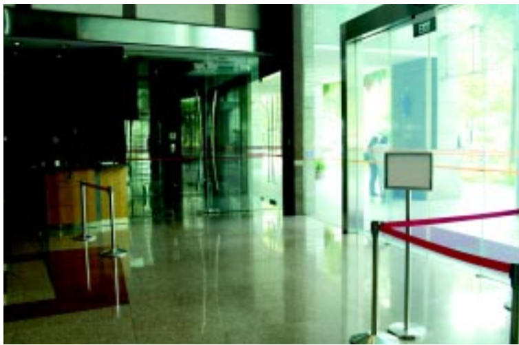
Clear line of sight from reception desk allows easy surveillance of entrance