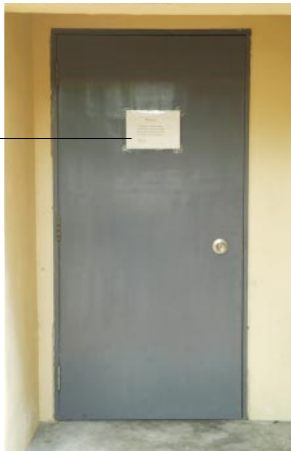
An entrapment area can be secured with some form of surveillance