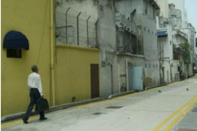
Back lanes should be well-maintained and free of inappropriate outdoor storage