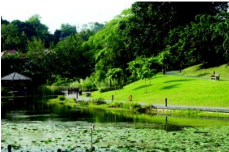
Parks and open spaces can be planned and programmed for a range of activities