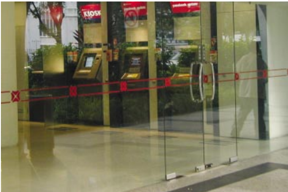
Banking facilities can be located near pedestrian activities to reduce sense of isolation

Most people feel insecure in isolated areas especially if people judge that signs of distress or yelling will not be seen or heard. People may shy away from isolated areas and in turn such places could be perceived to be even more unsafe. Natural surveillance from adjoining commercial and residential buildings helps mitigate the sense of isolation, as does planning or programming activities for a greater intensity and variety of use. Surveillance by the police and other security personnel to see all places at all times is not practical, nor economical. Some dangerous or isolated areas may need formal surveillance in the form of security hardware, i.e. audio and monitoring systems. Aside from its cost, the hardware must be watched efficiently and attentively by staff trained for emergencies.