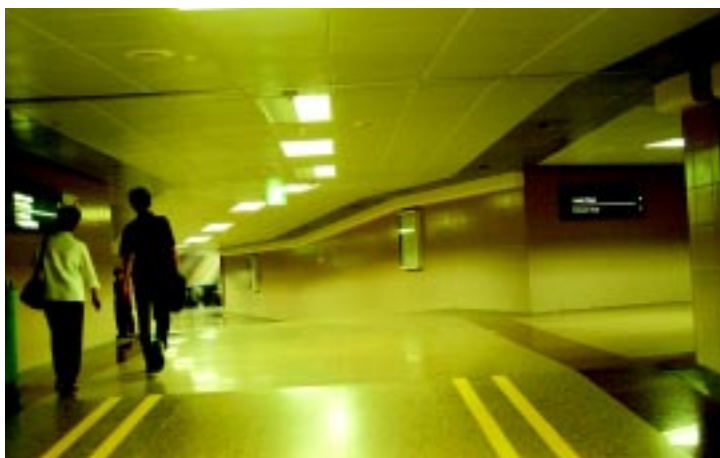
Pedestrian underpasses can be designed with good visibility and clear sight lines