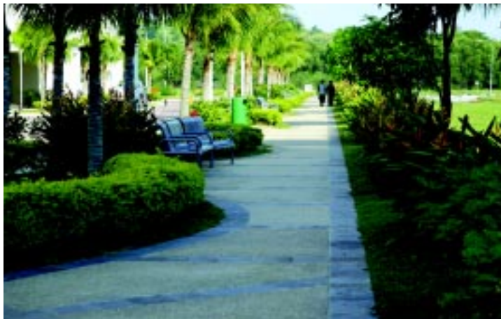
Walkways should be clean and well maintained