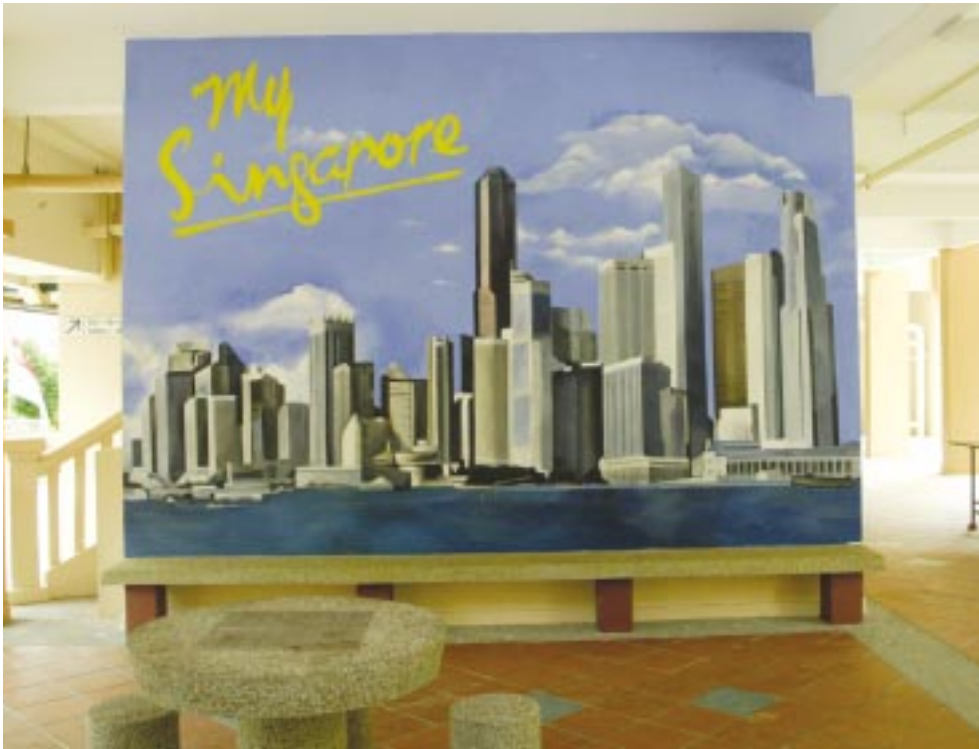
Artwork by residents of an apartment block at ground level promote sense of ownership

Sense of ownership, or territoriality, is often considered a vital factor in making a place safer. Taking responsibility and caring for an environment helps make it safer. If residents in a residential estate for instance, feel that the areas outside their doors do not belong to them, they will feel less safe, and will be less likely to intervene in a dangerous situation. Not knowing who has formal ownership contributes to insecurity since it is not clear who to report the problems to. On the other hand, measures taken to increase the sense of territoriality may sometimes increase opportunities for crime. The visual or real barriers separating many new housing developments from surrounding neighbourhoods may isolate residents from the wider community.