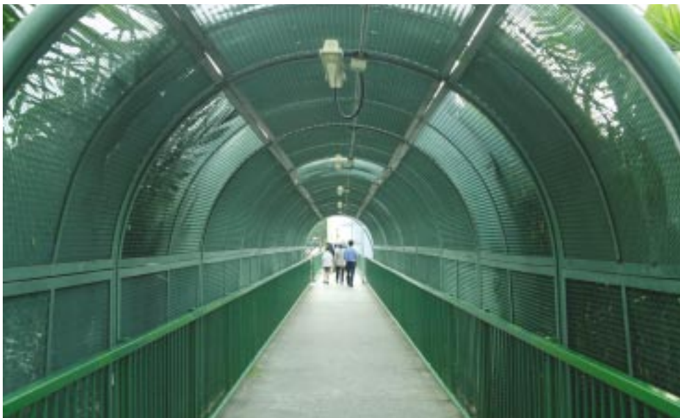
See through fencing covering a predictable route provides visibility

Concealed or isolated routes are often predictable routes that do not offer alternative for pedestrians. An attacker can predict where pedestrians will end up once they are on the path. Examples are underpasses, pedestrian overhead bridges, escalators and staircases. Predictable routes are of particular concern when they are isolated or when they terminate in entrapment areas.