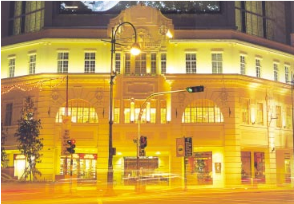
Exterior lighting for night time use should provide adequate visibility

Sufficient lighting is necessary for people to see and be seen. From a security point of view, lighting that is strategically placed can have a substantial impact on reducing the fear of crime. A basic level of lighting should allow the identification of a face from a distance of about 10 metres for a person with normal vision.