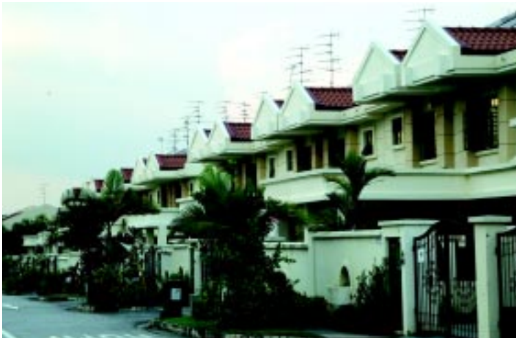
An active resident committee can promote proper management of the neighbourhood