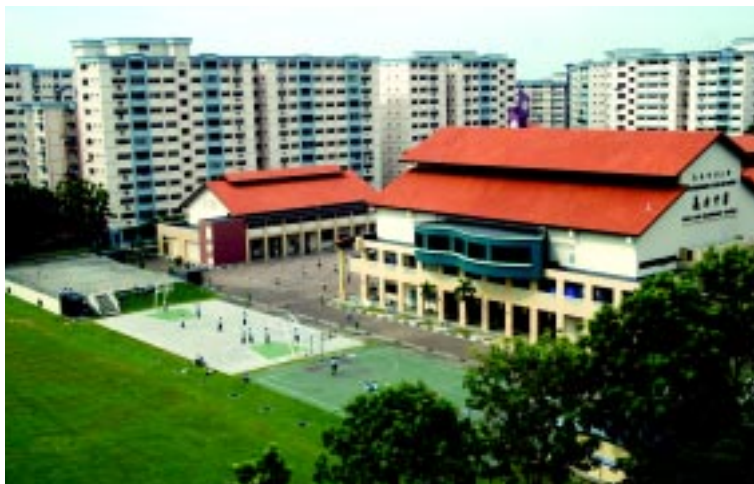
Location and landscaping of school can be arranged to encourage natural surveillance from surrounding buildings and streets