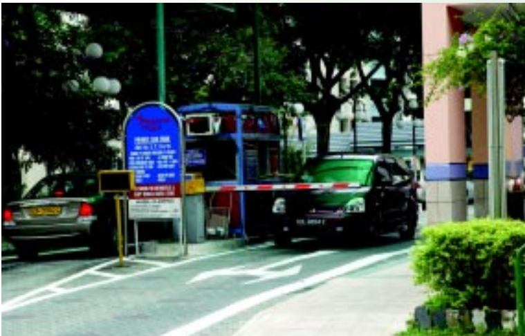
Attendant booth should be located near entrances and predictable routes