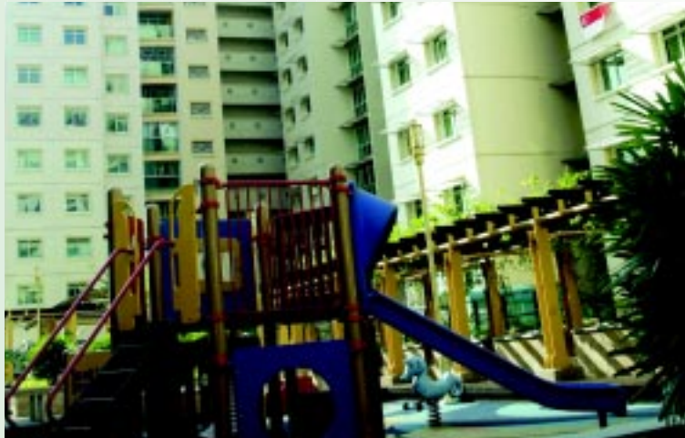
Residential apartments overlooking outdoor play areas provide natural surveillance