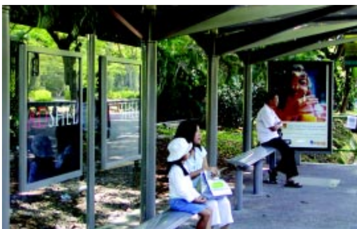
Materials and construction details for bus shelters should be vandal resistant