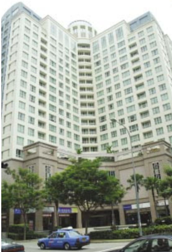
Compatible mixed uses can encourage activity, natural surveillance and contact among people

A balanced land use mix is important for environmental, economic, aesthetic and safety reasons. Mixed uses must be compatible with one another and with what the community needs. For a residential development, a number of uses can be included by having a main street, a town square or park, prominent civic buildings and above all the ability of residents to walk to the place of work, to day care centres and to shops. The social value of frequenting local businesses provides a sense of security and safety as the local business people “watch” the street. Generally, any design concept that encourages a land use mix will provide more interaction and a safer place.