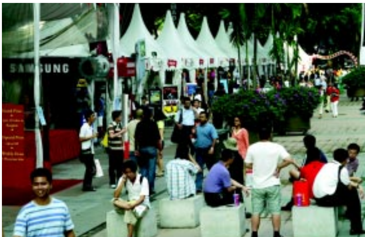
Retail and entertainment uses at street frontages attract and enhance pedestrian activities