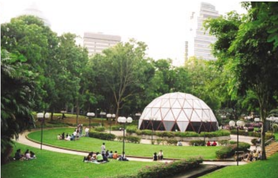
Open space within the central business district can be used for various activities

Activity generators are uses or facilities that attract people, create activities and add life to the street or space and thus help reduce the opportunities for crime. Activity generators include everything from increasing recreational facilities in a park, to placing housing in the central business district or adding a restaurant to an office building. They can be provided on a small scale or be added as supporting land use, or intensifying a particular use.