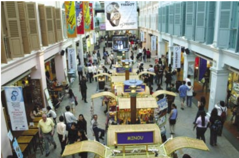
Good functional and aesthetic design can contribute to a sense of safety

The design and management of the environment influences human behaviour. A barren, sterile place surrounded with security hardware will reinforce a climate of fear, while a vibrant and beautiful place conveys confidence and care. Both the functional and aesthetic values of public and semi-public spaces contribute to a sense of safety. In particular, the degree to which users can find their way around influences the sense of security. Good design reinforces natural use of space and lessens the need to depend on signs in order to find one's way around.