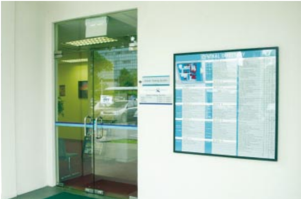
Maps and directories should be well designed and strategically located

Well designed, strategically located signs and maps contribute to a feeling of security. Signs should be standardised to give clear, consistent, concise and readable messages from the street. Having addresses lit up at night will make them even more visible. Where it is difficult to find one's way around; signs with maps may help. Signs must be visible, easily understood and well maintained. Graffiti and other vandalism can make signs unreadable. If signs are in disrepair or vandalised, it gives an impression of lack of ownership and thus adds to a sense of fear.