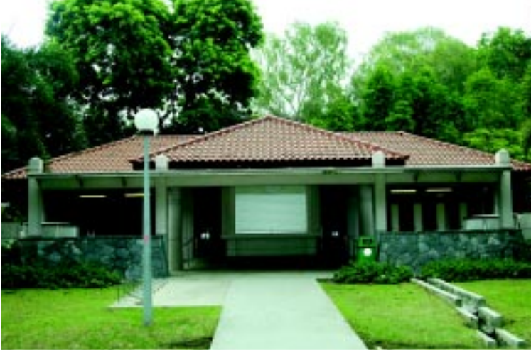
Approach to washroom entrances should be highly visible